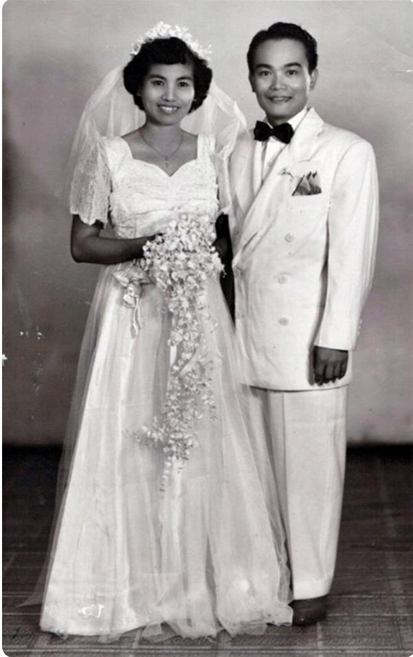
Wedding - March